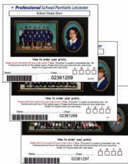
Dual mount packs come in three sizes